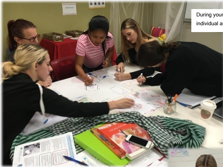
During your training we provide opportunities for both individual and group work.

Requests for access to your files must be in writing to the College Manager who must respond within 7 days of a reasonable request.