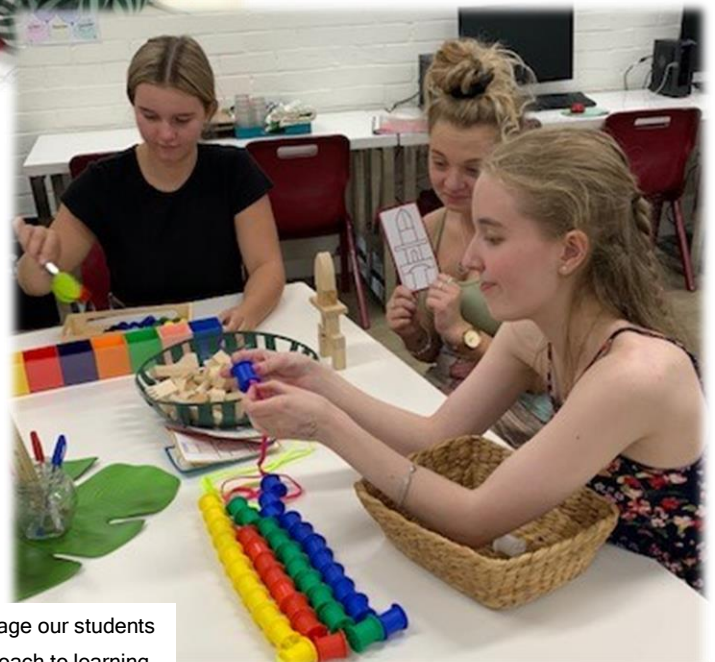
At Tillys College of Childcare we encourage our students to take an active, hands-on approach to learning.